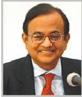
SHRI PALANIAPPAN CHIDAMBARAM HOME MINISTER, GOVERNMENT OF INDIA

P. Chidambaram is currently the Minister of Home Affairs in the Government of India, a position he has held since December 2008 (following the terror attacks in Mumbai in November 2008). Prior to this, from 2004-2008, Mr. Chidambaram was the Finance Minister of India, a period during which he helped cement India's progress towards economic reforms and accelerated economic growth. He was also the Finance Minister previously from 1996 to 1998. A lawyer by training, Mr. Chidambaram is a member of the All India Congress Committee, has been a Member of Parliament since 1984, and has held positions of political leadership including Minister of State for Personnel, Public Grievances and Pensions (1986-1989); Minister of State for Internal Security (1986-1989); and Minister of State for Commerce (1991-1992 and 1995-1996).