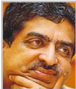
SH. NANDAN NILEKANI CHAIRMAN (UIDAI)